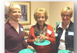
Enjoying some delicious hors oeuvres

One thing is for sure. We will need to find a new venue. 35 people in the Clubhouse is, well, a full house. If we have more people, we will need to find a restaurant or lounge or other venue that will hold more people. Come join us!